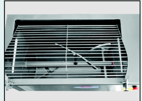
Stainless Steel Grill type Lid

Contact us for a list of un-biased Hall Equipment users in your region/state.